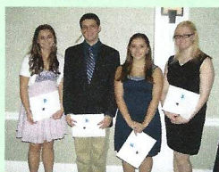
Last Year's Winners

On Friday September 21st the 2012/2013 Scholarship Overview and Application was emailed to all members. The RIFDA Scholarship Program will be offering four (4) $1,000 one time non-renewable scholarships. The application deadline date is November 2, 2012. Please call 401-431-0880 or visit www.rifda.com for an application.